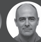
Inon Eroy Economic Minister to North America Government of Israel