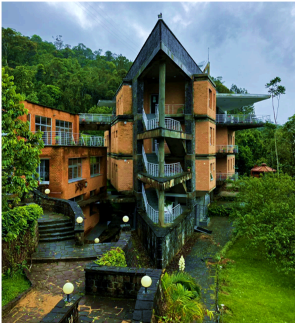
Namanabe Hall at Centre ValBio in Ranomafana, Madagascar.