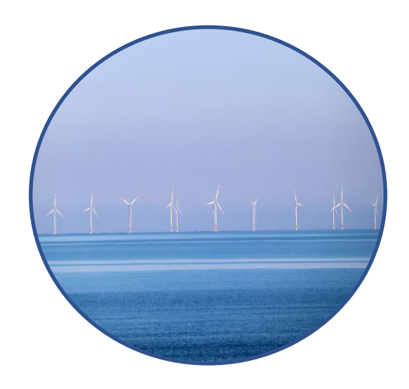
Offshore Wind US - SCD